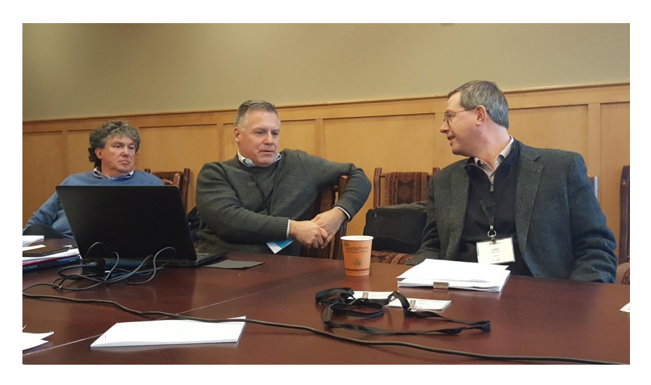
Your ACSUS Executive Committee hard at work after the MANECCS Biennial conference, Lake Placid Convention Center, Saturday, October 27, 2018.